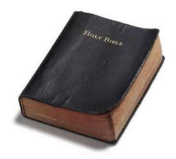
The Bible is the Word of God